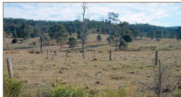
General Location of Proposed Mining – Viewed to the North West

Following the public exhibition period, DoP will consider submissions from the public and regulatory authorities.