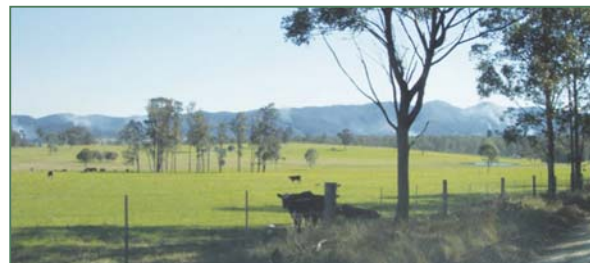
General Location of Proposed Avon South – Viewed to the South West

Following the public exhibition period, DoP will consider submissions from the public and regulatory authorities.